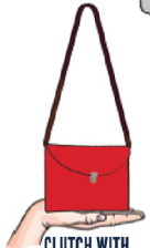
CLUTCH WITH SHOULDER STRAP NO LARGER THAN 4.5" X 6.5"