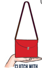
CLUTCH WITH SHOULDER STRAP NO LARGER THAN 4.5" X 6.5"