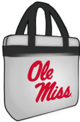
12" X 6" X 12" CLEAR PLASTIC BAG