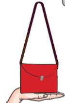
CLUTCH WITH SHOULDER STRAP NO LARGER THAN 4.5" X 6.5"